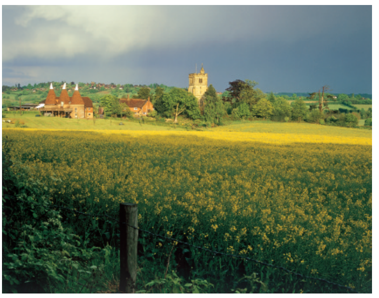
Horsemonden Church Rapefield