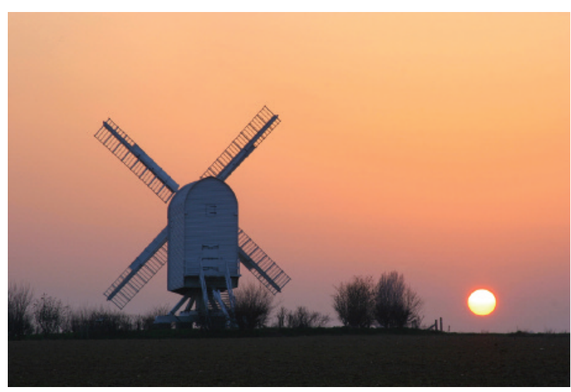
Sunset over Chillenden Windmill