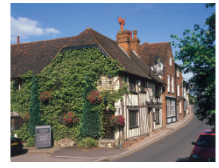
Above: Charles Dickens was a frequent visitor to The Leather Bottle public house in the delightful village of Cobham.

Right: An early summer's morning sees the beach at Broadstairs after it has been vacuumed by the litter tractor.